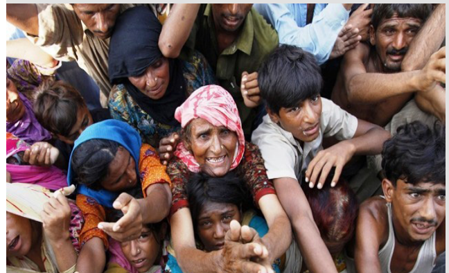
Locals struggle to get food donated by a local charity at Karamdad Qureshi village in Dera Ghazi Khan

Satellite imagery shows floodwaters from the Indus reaching Balochistan province, where the number of people in need of assistance continues to grow. UNHCR reports that the provincial government has established and is managing five camps in the province, in Quetta, Sibi, Dera Hurad Jamali, Dhader and Noutal. The majority of the flood-affected population in Balochistan is reported to have been displaced from neighboring Sindh.