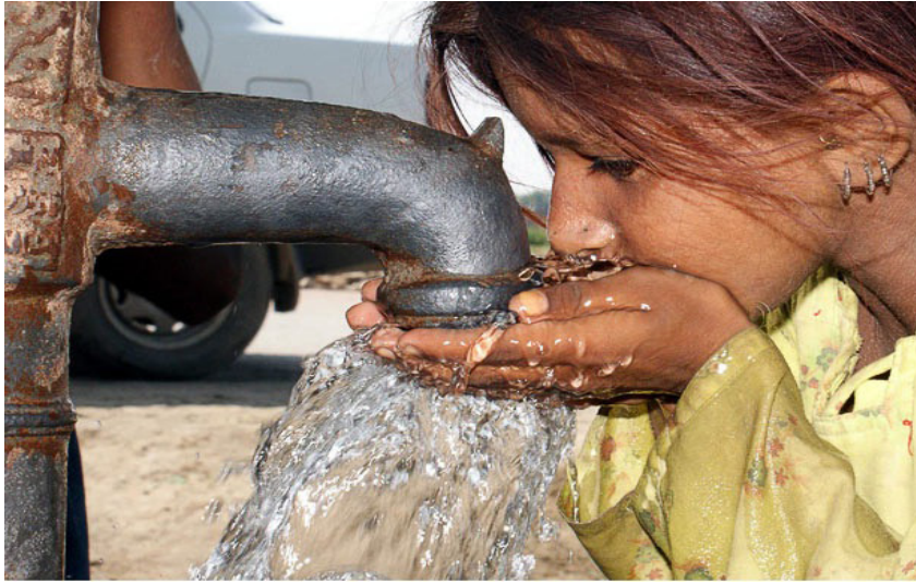
A young flood victim drinks water from a community tap near a tent camp in Sukkur