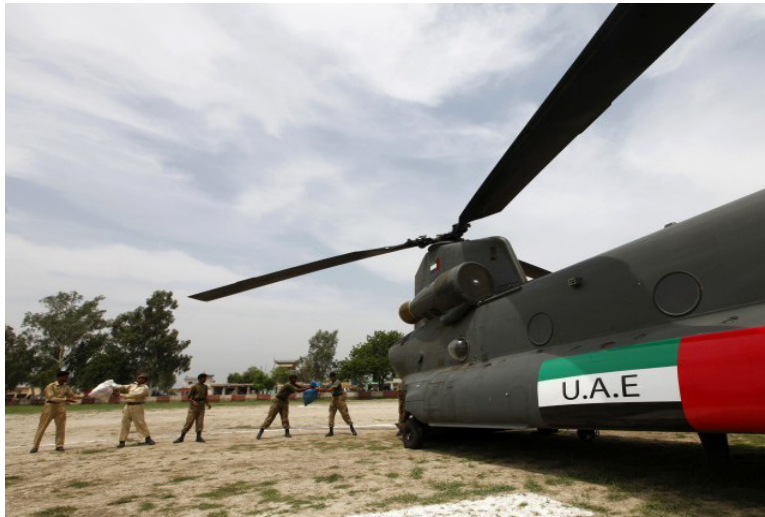
Pakistani soldiers unload relief goods from a UAE helicopter in Alipur, Muzaffargarh