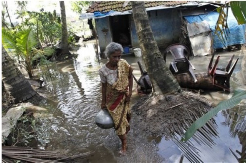
A Sri Lankan flood victim carries a pot of drinking water at submerged compound in Kartivu