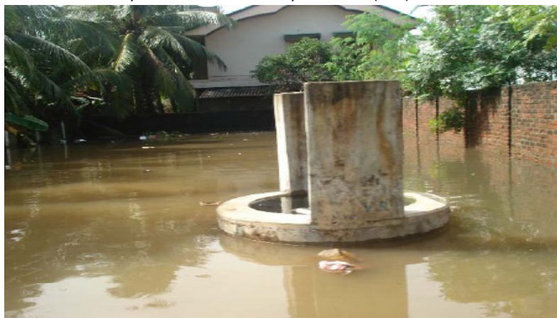
Drinking wells affected by flooding